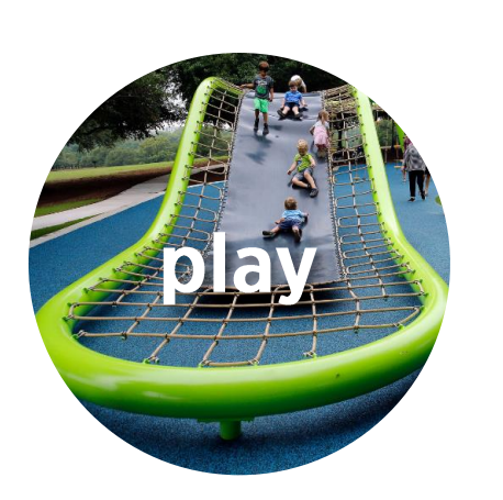
playgrounds pickleball bocce table tennis dog park tot lots